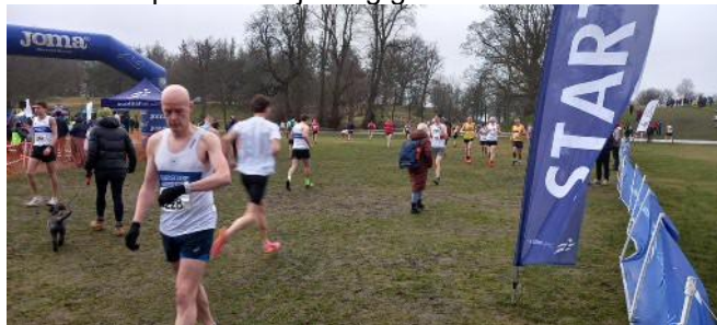
Athletes Final Warm-up Area Between Start and Finish