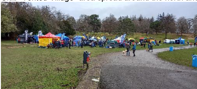
Club "Tented Village"