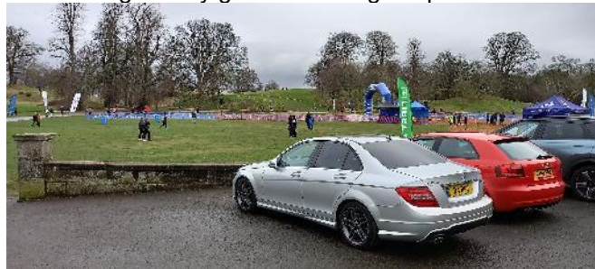
On Race Day

Regular pre-race inspections of the area were made, provided reassurance on ground conditions and finish siting went ahead as planned, but excluding traffic on the grass.