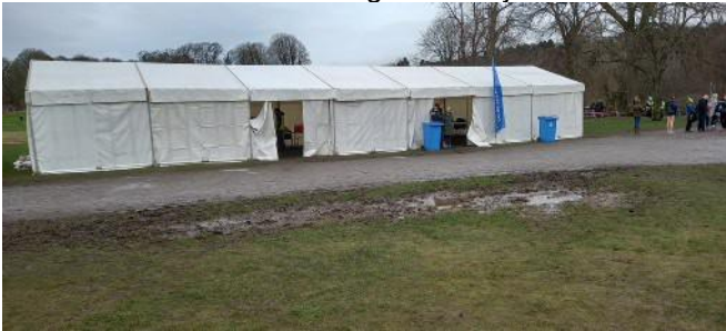
Declarations and Officials Report Marquee