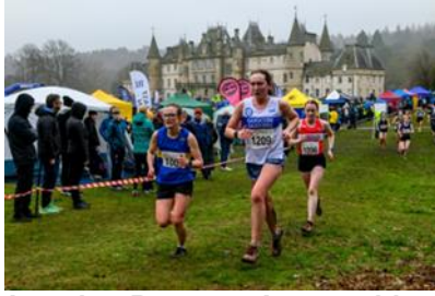
Lapping Runners Approaching Split directed left