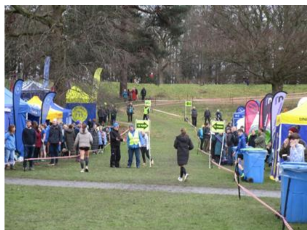
“Finishers Only” Channel Split