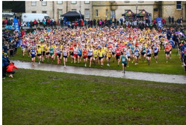
The Senior Men's Race Start