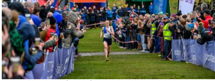
"Finishers Only" Channel at Marshal Point 19