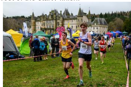
Course Through "Tented Village"